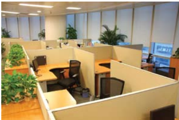
Office infestations commonly come from workers or visitors who live in bed bug-infested homes.