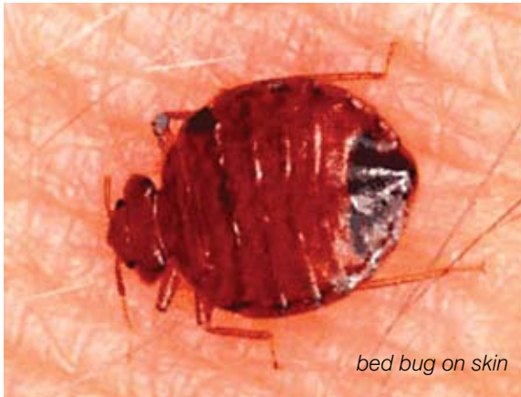
bed bug on skin